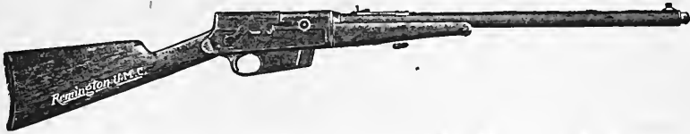
REMINGTON AUTOLOADING RIFLE—ONE OF BROWNING'S PATENTS

21 W. South Temple St., Salt Lake City, Utah